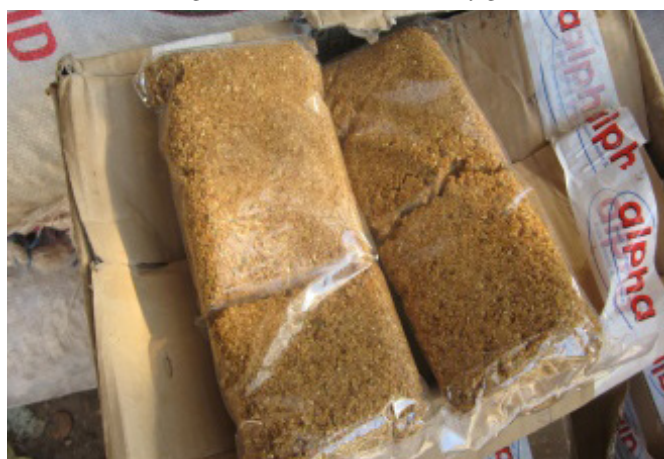
Figure 3: Grounded dried fig

Seven size classes have been identified: