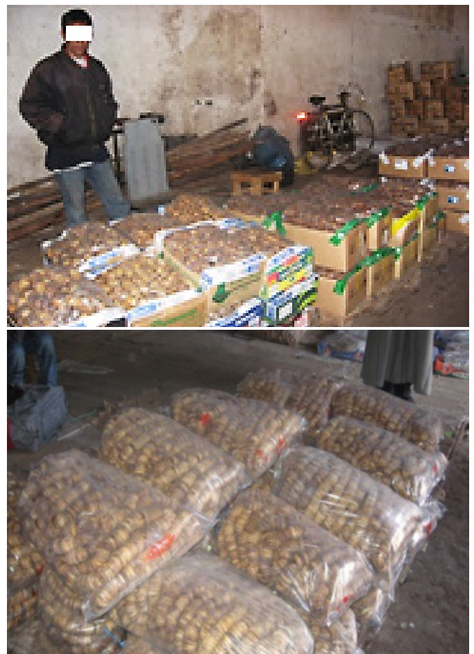
Figure 1: Wholesalers selling figs in plastic bags

In addition, retailers of dried figs obtain their supplies from wholesalers, a total of 50 retailers (30 in the city of Marrakech and 20 in Casablanca) were located and surveyed. The places where dried figs are sold are often shops selling spices, aromatic plants and dried fruits. It was noted that at the retailers located in the various sales points prospected, the dried figs most often threaded in loops are exposed to the open air and are neither conditioned nor packed.