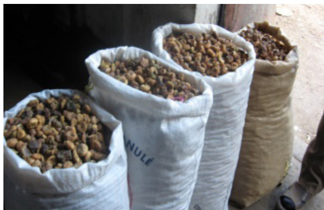
Figure 2: Low market value figs

The quality of Moroccan dried fig samples was evaluated according to an international standard (European standard UNECE DF 14). The main criteria required by the standard are of a commercial nature (size, uniformity of appearance of the fruit, freedom from defects and foreign matter, total absence of insects and moisture content). Table 2 shows the different size classes of the samples analysed.