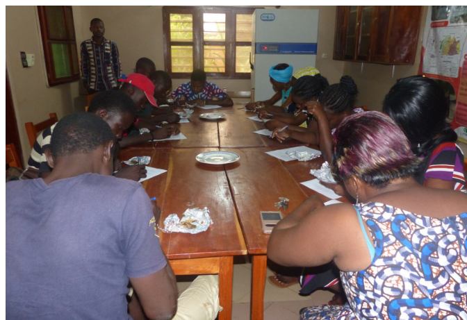
Figure 1: Panel assessing the organoleptic quality of the smoked Clarias gariepinus

Fish organoleptic quality assessment was done the day after the smoking process. The evaluation panel was composed of 12 members (6 men and 6 women) who regularly consume fish and are non-smokers. They were trained on the evaluation procedure. Panelists were ad-