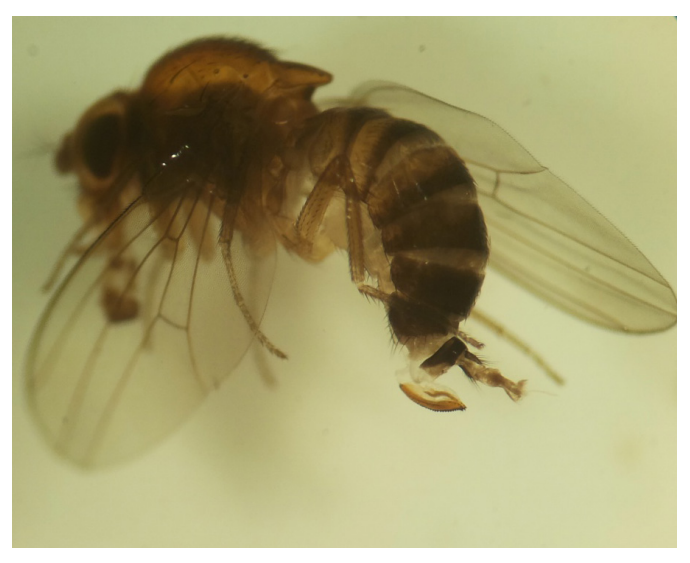
Figure 2: ovipositor of Spotted Wing Drosophila