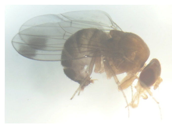
Figure 1: General view of Drosophila suzukii male. The black spots can be observed in the male's wings

The SWD male can be recognized based on the spots in their wing (Figure 1). The female posses a long and narrow ovipositor with sclerotized black teeth (Figure 2 and Figure 3).