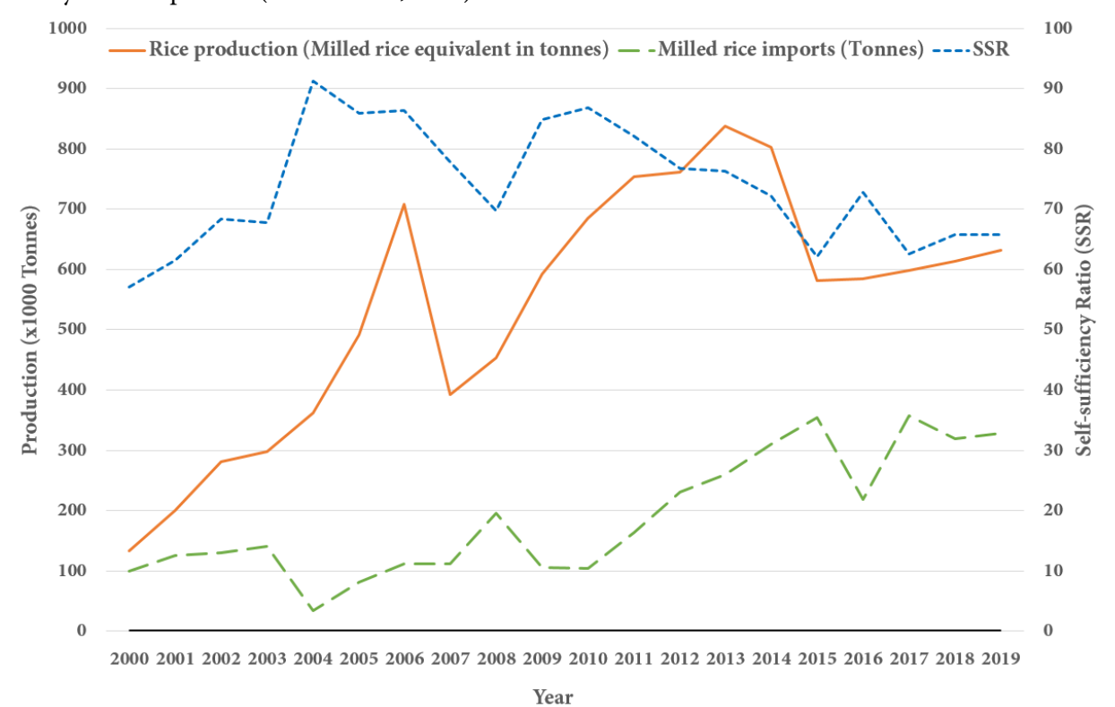
Figure 2: Rice self-sufficiency ratio of Sierra Leone from 2000 to 2019 (FAOSTAT, 2020)

The production and consumption of local rice remain the crucial strategies to enhance rice self-sufficiency, stimulate economic growth and thus improve the livelihoods of rice farmers (Bah, 2013). The rice selfsufficiency ratio (SSR) is expressed as (rice production x 100 / (rice production + rice imports)) (Faostat, 2015) for the countries with no rice exports. Precisely, when the ratio of rice production to rice consumption is greater or equal to one, its self-sufficiency is attained (van Oort et al., 2015). According to figure 2, Sierra Leone attained an SSR of 91 in 2004 despite the undulating increase in milled rice imports and milled rice production. Between 2000 and 2019, the quantity of milled rice produced was always greater than that of milled rice imported. The average yield of rice in the country never reached 2 t/ha despite the increase in the cultivated area during this period. To boost rice production and productivity, AfDB (2020) approved the US$11 million Agribusiness and Rice Value Chain Support Project in Sierra Leone. In 2018, the country needed to produce roughly three million metric tonnes of paddy to achieve full self-sufficiency (Fofana et al., 2014). This estimate is proportional to the population growth rate.