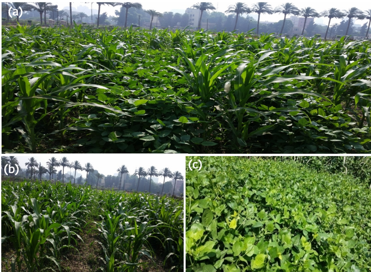
. Figure 1: Maize and cowpea cropping systems:(a) cowpea intercropped with maize (50% cowpea+100% maize), (b) solid maize (100%) and (c) solid cowpea (100%)

beds, 140 cm width, by sowing one grain/hill distended 25 cm apart (Figure 1 a,b). Solid cultivation was used to estimate the water equivalent ratio.